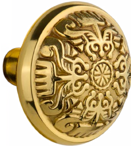
Eastlake Knob shown in Polished Brass